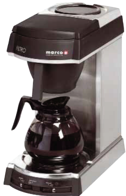
Filtro Mini Flask Mini Manual Fill